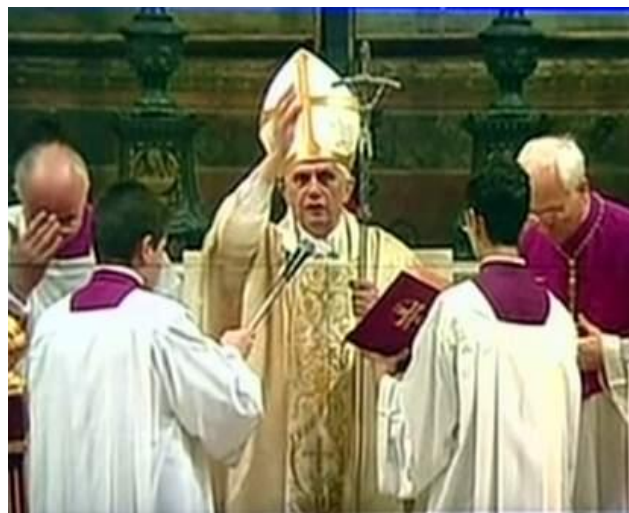
Are they serious? Where did Jesus ever suggest such bizarre behaviour for Christians?

Up until now it has been open slather in the thousands of Christian churches who masquerade as the Church that Christ built. The leaders of all these churches developed their own style of deluding their followers with feigned righteousness. Some suited up in silly robes and wore stupid hats, while others perfected the pained-expression-on-the-face syndrome that left people teary-eyed and losing emotional control. The carefully-timed collection plate would arrive around this time. Regardless of the sort of ridiculous pantomime that was enacted, the overall purpose was to delude people into believing that this was the kind of worshipper that God favoured.